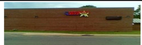
Cannon Ball Lanes Dahlgren