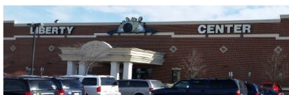
Liberty Center Massaponax