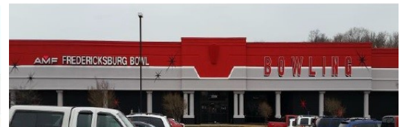
AMF Fredericksburg Lanes