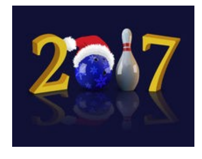
AMF Dale City Lanes Woodbridge