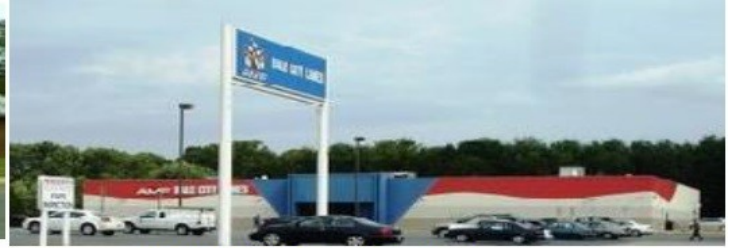
AMF Dale City Lanes Woodbridge