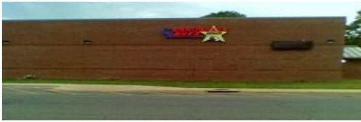
Cannon Ball Lanes Dahlgren