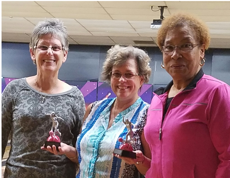
Senior Tournament—1st Place Doubles