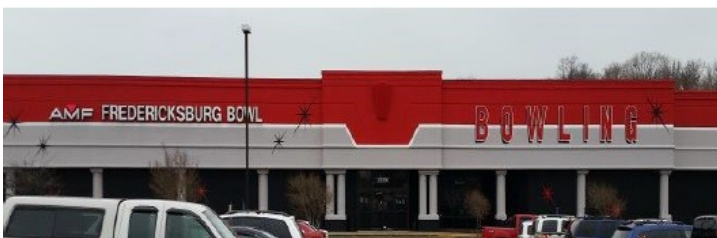
AMF Fredericksburg Lanes