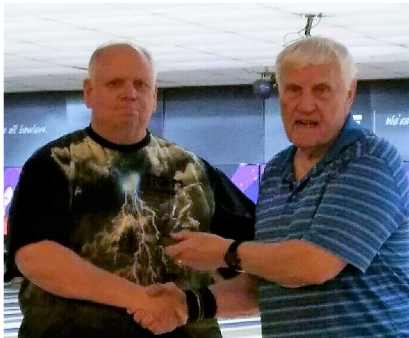
Senior Tournament—1st Place Singles Division I