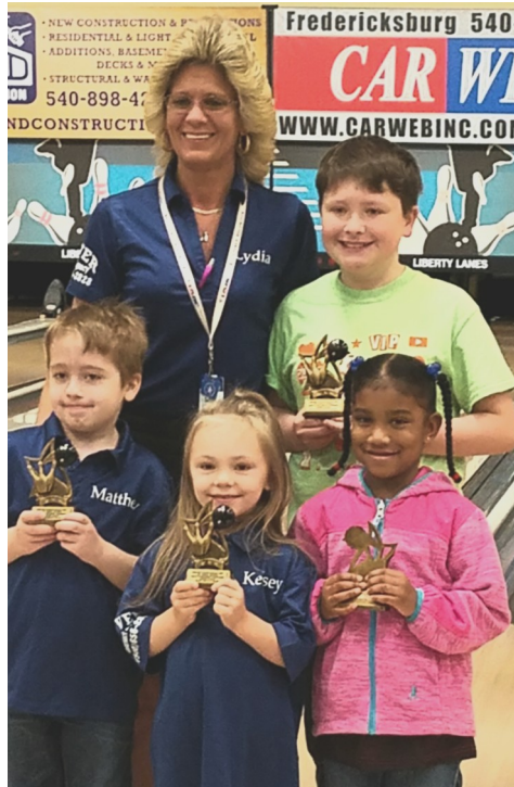
Saturday Youth Legends Bumpers with their medals!