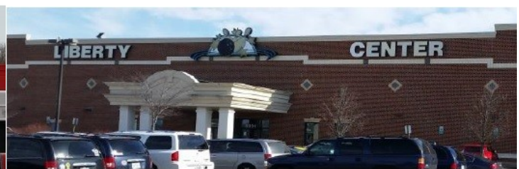
Liberty Center Massaponax