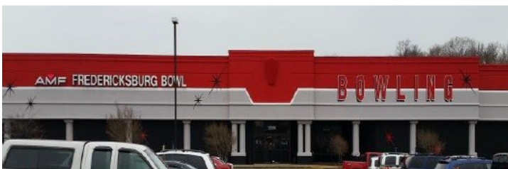
AMF Fredericksburg Lanes

Any GFUSBCA member can and are encouraged to submit articles, announcements, etc. for this newsletter. If you have an event/news, please email the Association Manager.