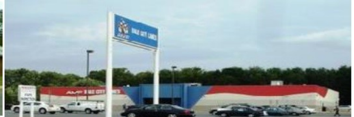
AMF Dale City Lanes Woodbridge

Are you interested in supporting your association, we have the following committees that could use your help: