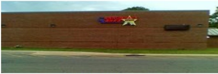
Cannon Ball Lanes Dahlgren