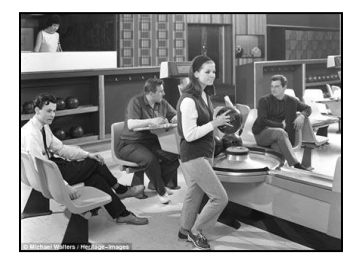
The White family is a bowling family.