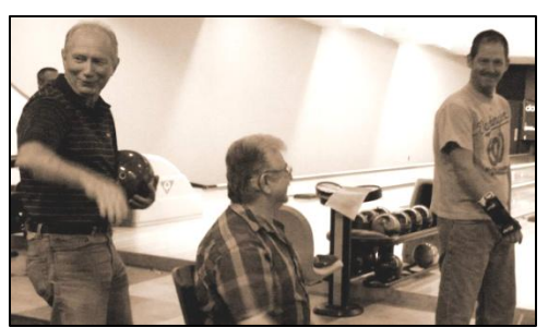
It's all smiles "before" the bowling starts.