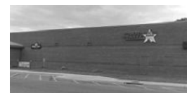
Cannonball Lanes Dahlgren