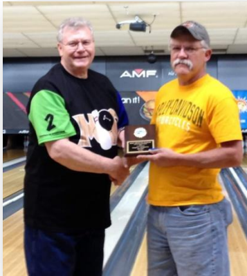
The Fuzzy Fox smile!